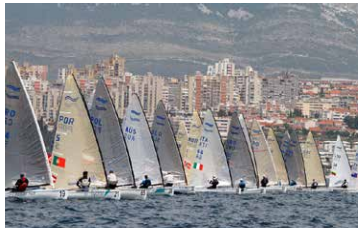
Sailing conditions were excellent the penultimate day of the regatta