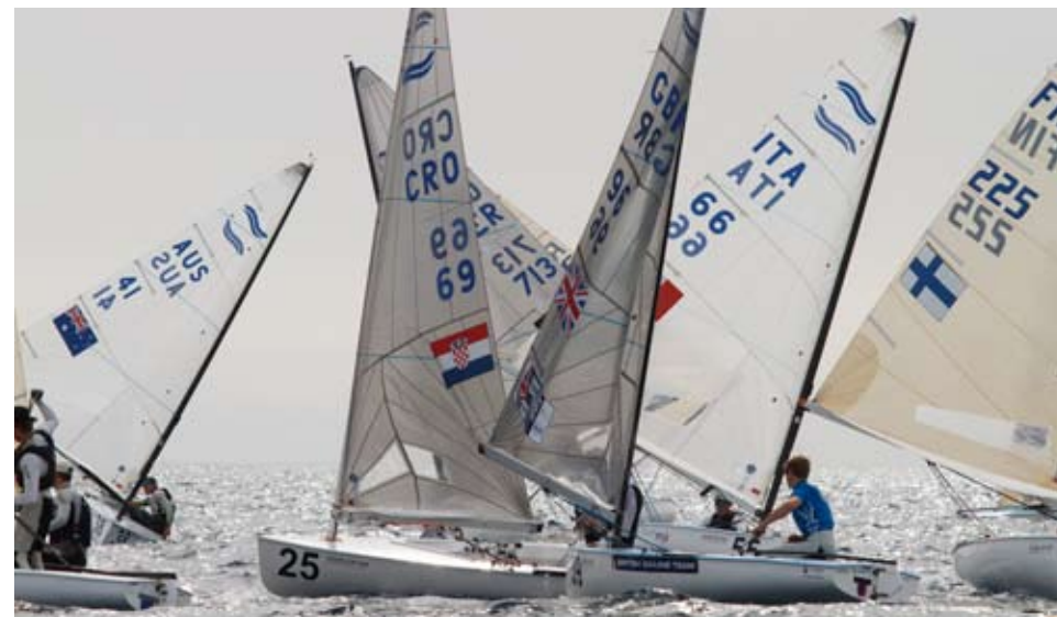
Sailors suffered on third race light wind