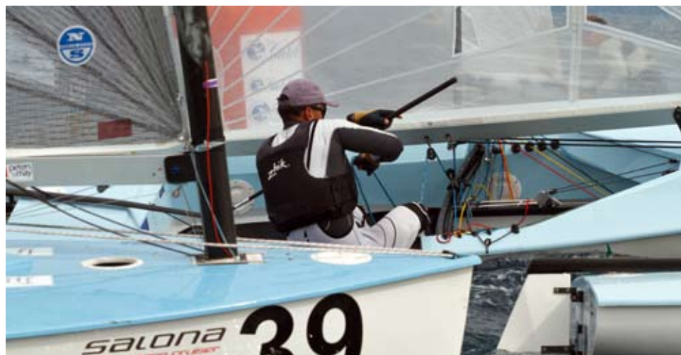
Today's race was difficult and demanding